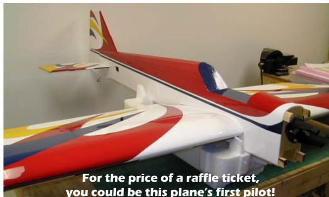
For the price of a raffle ticket, you could be this plane's first pilot!

REMINDER: You can renew your AMA memberships NOW, and submit your club application ASAP to receive the $25 early renewal discount! The early renewal discount ends March 4 th !